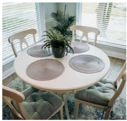
Table & Chairs Quantity:4 Price: $1,000